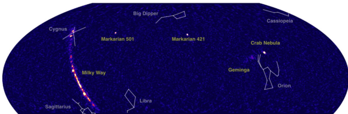
Figure 2: A view of 2/3 of the entire sky with very-high-energy gamma rays observed by HAWC. Clearly visible are many sources in our own galaxy, the Milky Way, as well as two other galaxies: Markarian 421 and Markarian 501. Some well known constellations are shown as a reference. The center of our own Galaxy is towards Sagittarius.